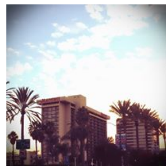
This year’s Excellence in Journalism venue: the Anaheim Marriott.

“Nothing gets out there that they don’t want to get out there,” he said.