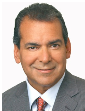
Jim Avila, senior national correspondent for ABC News.

The bills were reintroduced in the U.S. Senate and House of Representatives as the “Free Flow of Information Act of 2013” and S.987 in May, amid controversial National Security Agency leaks by Edward Snowden that included disclosure that journalists at the Associated Press and Fox News reporter James Rosen were tracked and monitored.