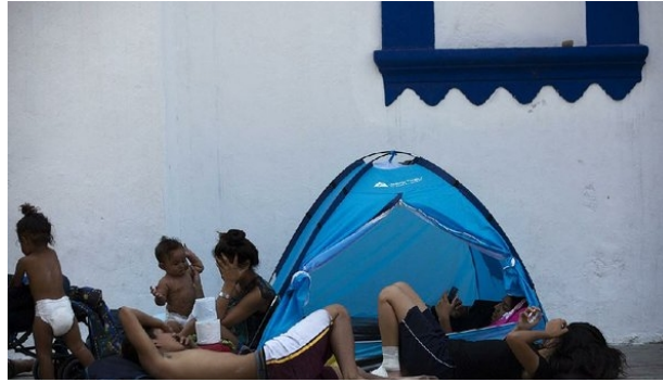
Caravan route less welcoming