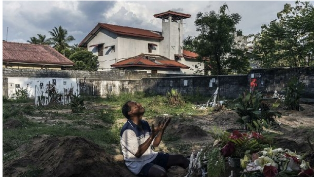
As deaths rise to 359, ISIS claims Sri Lanka bombings