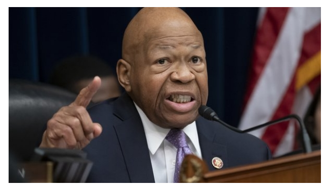
Panel delays deadline on Trump files