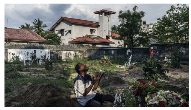
As deaths rise to 359, ISIS claims Sri Lanka bombings