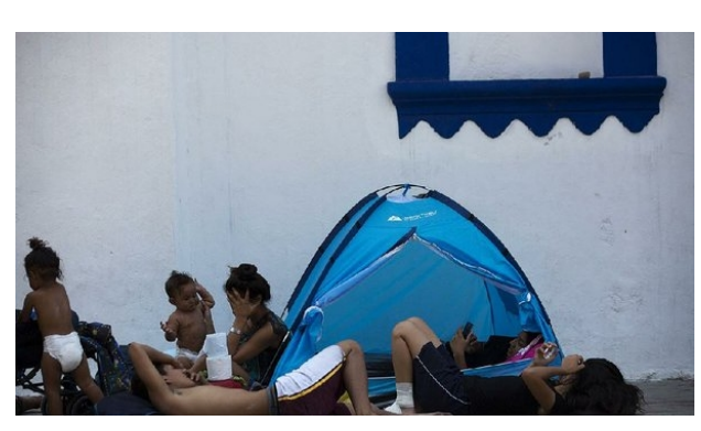
Caravan route less welcoming