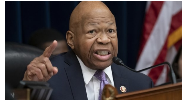
Panel delays deadline on Trump files