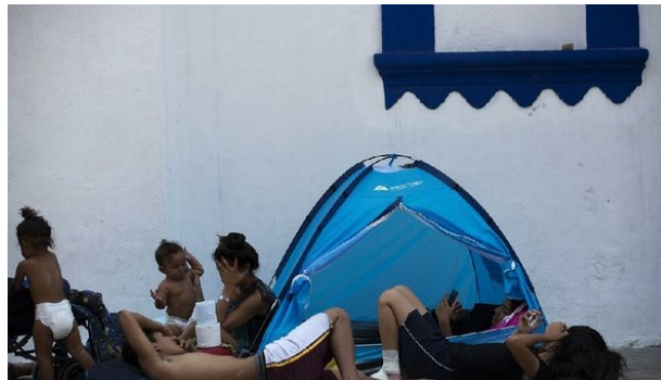
Caravan route less welcoming