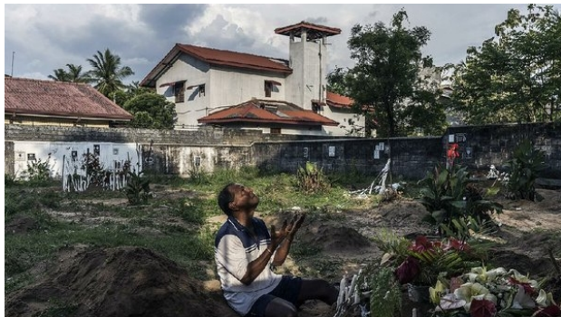
As deaths rise to 359, ISIS claims Sri Lanka bombings