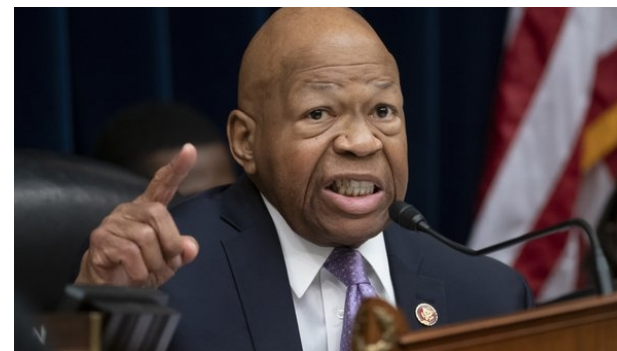
Panel delays deadline on Trump files